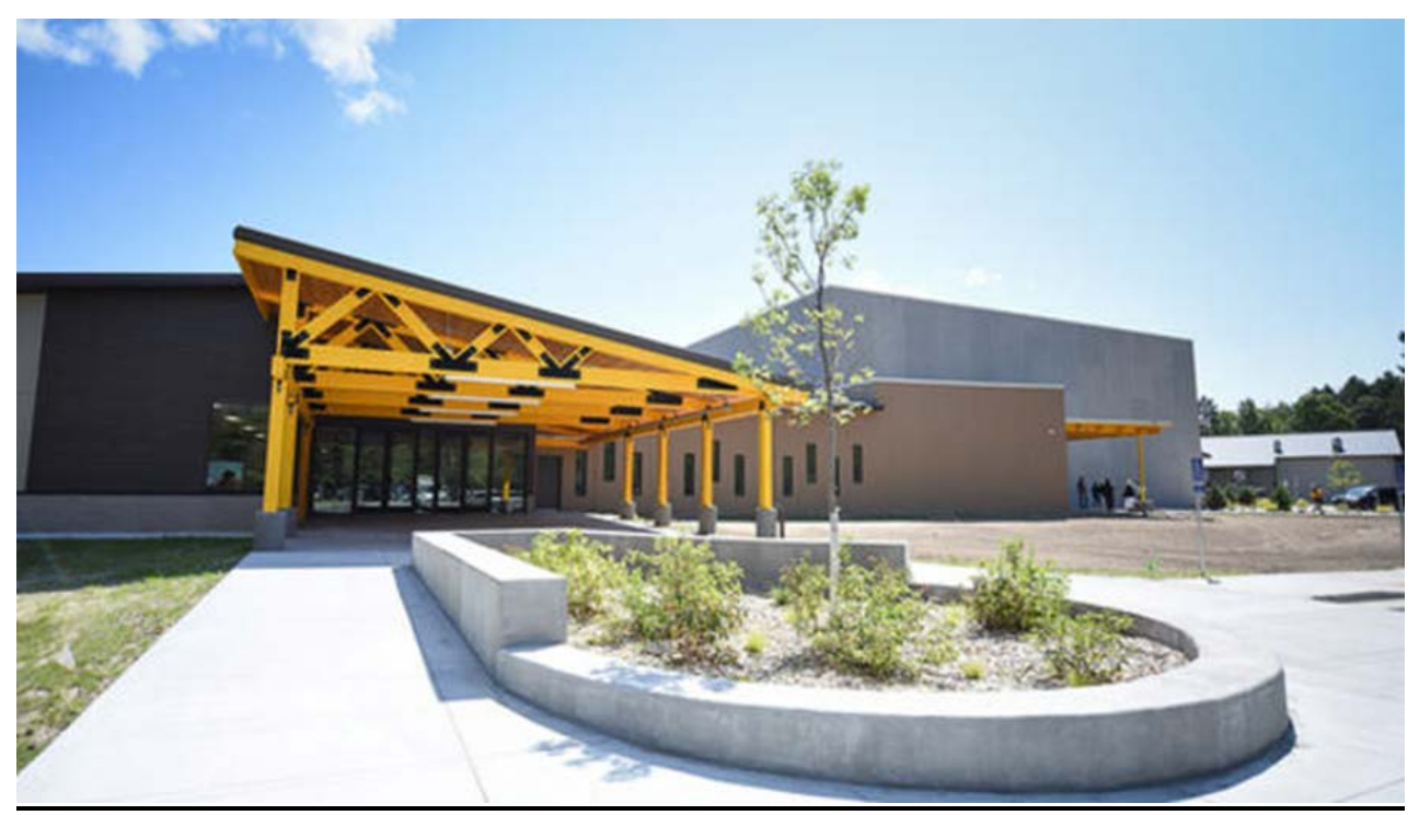
Bug-O-Nay-Ge-Shig High School in Minnesota

Using prior year available funds, IA will continue construction of the facilities replacement projects at Many Farms Community School and Atsa Biyaazh Community School Dorm with anticipated completion for both projects in FY 2021. Unlike the "Replacement School Construction" program that replaces entire school campuses, the "Replacement Facility Construction" program replaces single academic related buildings. Buildings to be replaced are placed onto an approved facility replacement list using a deliberate evaluation and screening process. Academic related facilities selected are in poor condition and have exceeded their original design life.