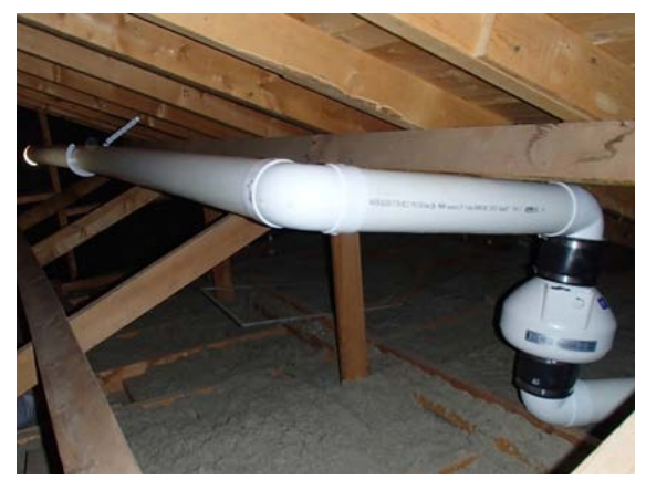
Radon Exhaust Fan Installed at Blackfeet Dormitory Quarters Units

Funds requested in FY 2020 will be used to continue efforts to abate environmental hazards in accordance with environmental laws and regulations. Specifically, funds will be used to assess, characterize, remediate, and monitor potential or actual releases of environmental contaminants at BIE-owned education facilities. Environmental projects will include the upgrade or replacement of storage tanks, wastewater systems, water systems, water towers or wells; removal and disposal of contaminated soils and hazardous or toxic materials; abatement of asbestos and lead paint; and sampling