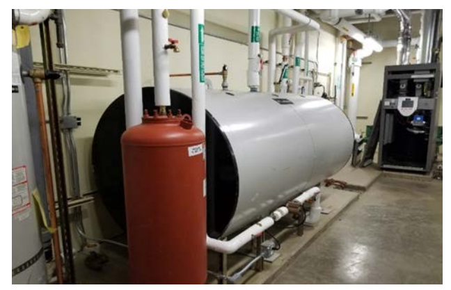
Boiler at Blackfeet Dormitory in Montana

Funds requested in FY 2020 will be used for structural design of buildings requiring seismic retrofitting. This program is in compliance with provisions of Executive Order 12941, Seismic Safety of Existing Federally Owned or Leased Buildings, which requires Federal agencies to assess and enhance the seismic safety of existing buildings