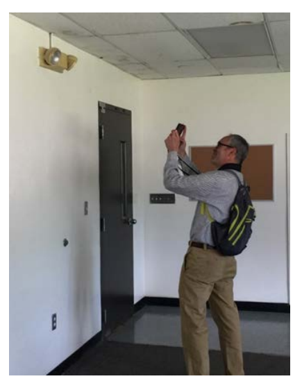
Facility Condition Assessment at Cheyenne Eagle Butte School in South Dakota

Funds requested in FY 2020 will be used to complete a comprehensive condition assessment and