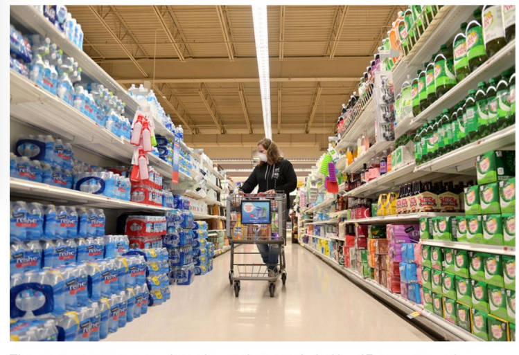
The most recent survey data shows that nearly half – 47 percent – of households reported spending their tax credit payment on food.

The monthly payments of up to $300 for each kid under five and up to $250 for each kid under 18 are the result of one of the most sweeping provisions in the American Rescue Plan.