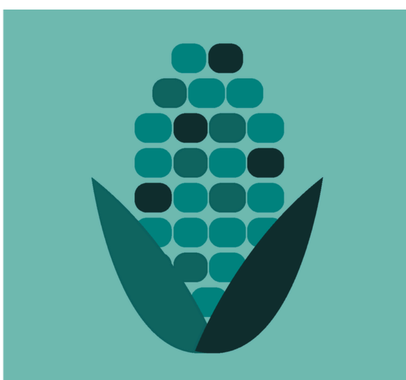
NOVEMBER: BLUE CORN