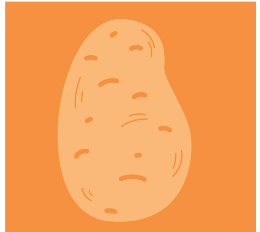
MARCH: SWEET POTATO