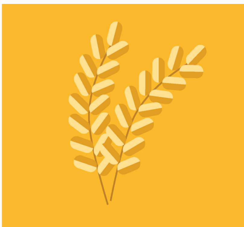
AUGUST: WILD RICE