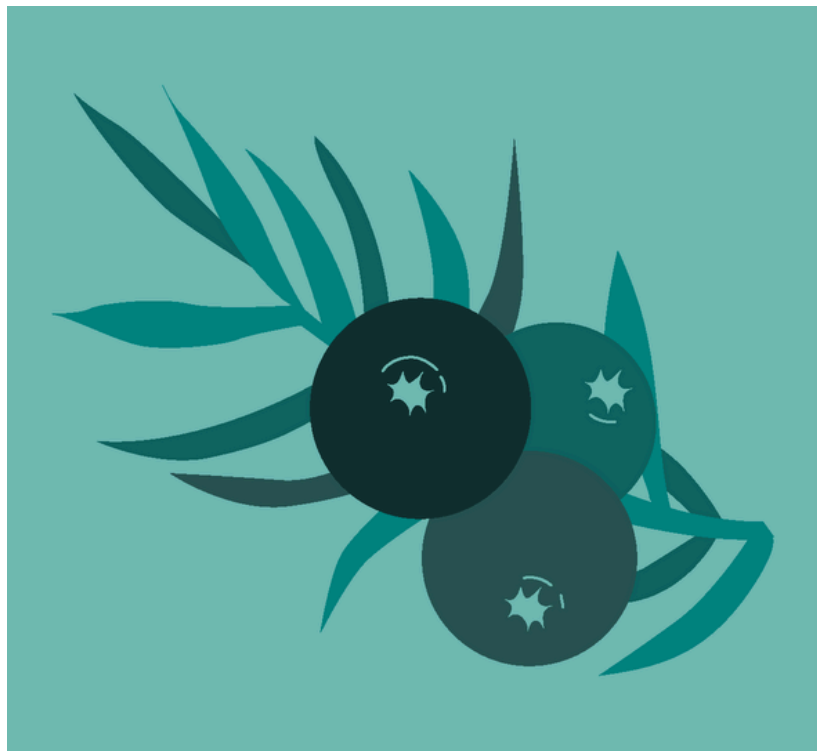
APRIL: JUNIPER ASH