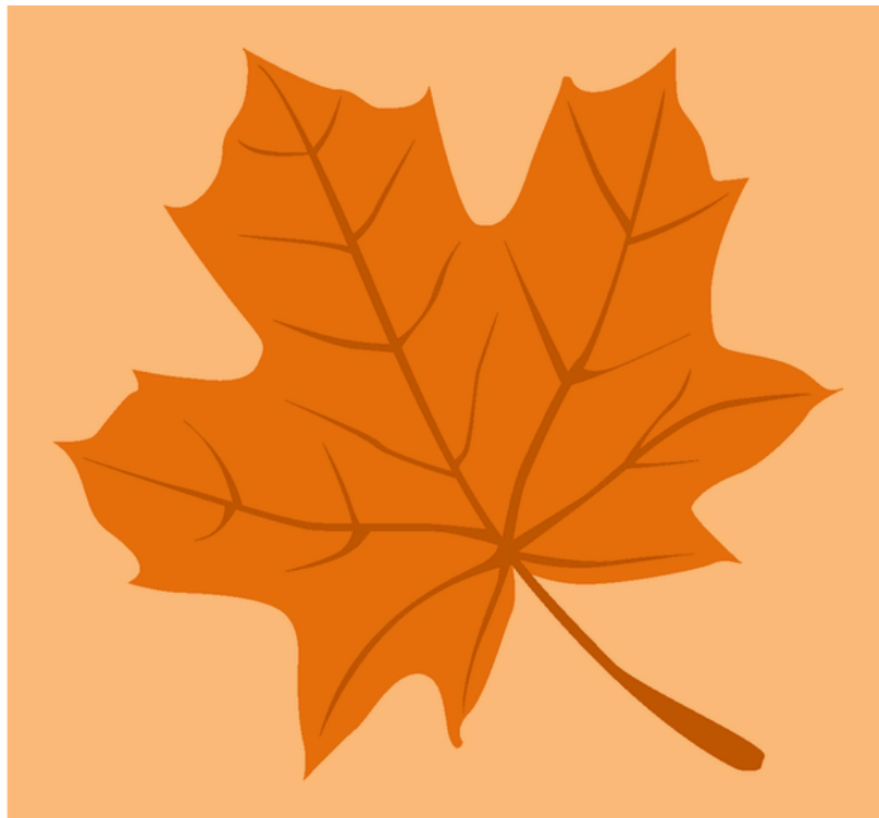
FEBRUARY: MAPLE SYRUP